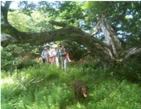
The famous Big Head birch